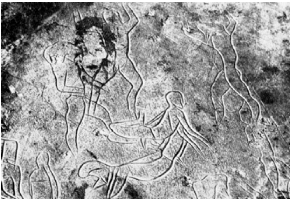
Rock-carvings from 15000 - 10000 B.C. showing Yoga asanas. Found in Addaura, Sicily.

The original Yoga is called Mahayoga, that is, the highest Yoga. It is characterized by its eight constituent parts, technically called ashtangayoga . From more than 100 various yoga doctrines that have been substantiated hitherto four principal doctrines have emerged. This is evidenced by the Upanishads, thus indicating the Vedic origin of these doctrines. These are: