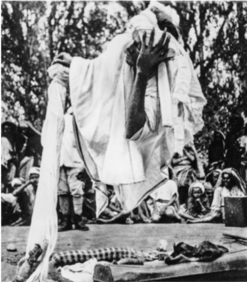
Mantra levitation demonstration in India

The British observer of this extraordinary feat of superhuman powers checked that there was actually no faking in this performance, to make sure that there was no other support than the stick on which the yogi's hand was resting, by passing a stick above, underneath and around the yogi's body.